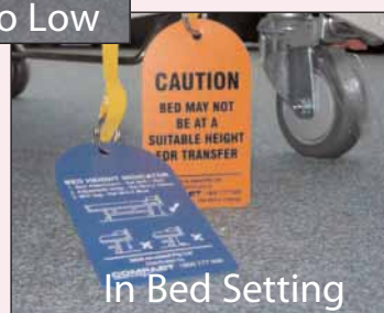
In Bed Setting